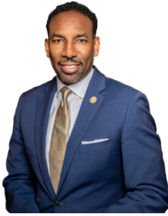
Andre Dickens MAYOR