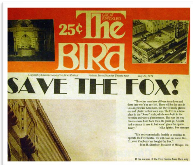
Fox Theatre Archives

Bake sales. Benefit concerts. A shared belief that losing the Fox would mean losing something irreplaceable.