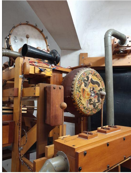
ORGAN CHAMBER INSTRUMENTS

Affectionately known as “Mighty Mo,” the Fox Theatre’s legendary Möller pipe organ has captivated audiences for decades. As the largest of its kind ever built by Möller, it remains a treasured symbol of the Fox’s legacy and commitment to preserving theatrical tradition.