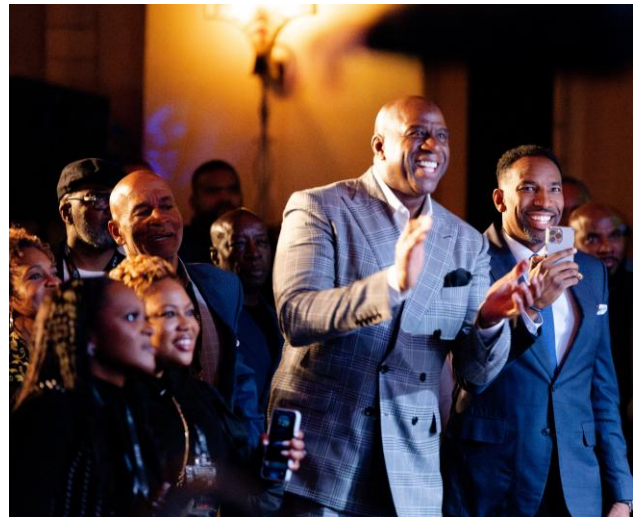
Magic Johnson Foundation's Championship Soirée