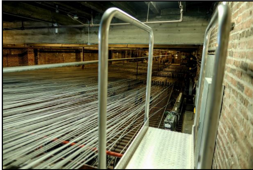
GRID TOP VIEW