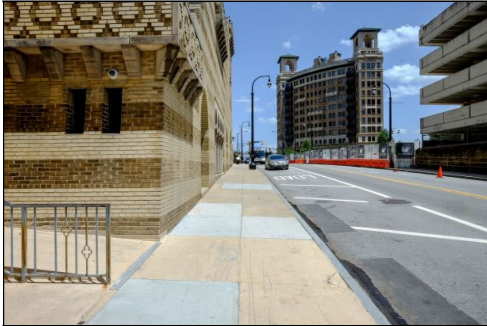
OUTSIDE STAGE DOOR / LOADING ZONE