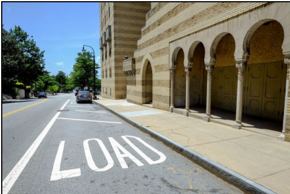
LOADING ZONE on PONCE DE LEON