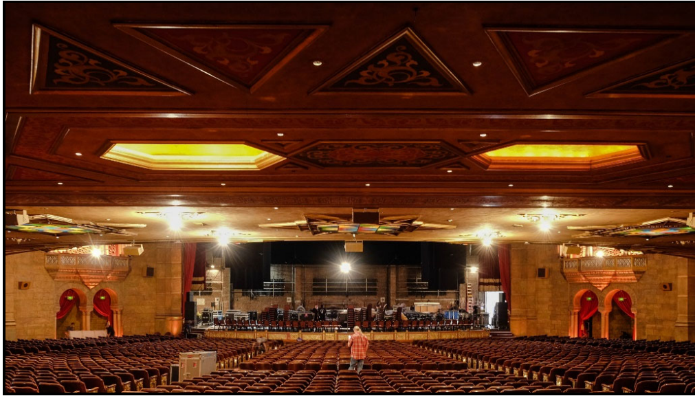
OASIS MIX POSITION VIEW FROM MIX TO STAGE