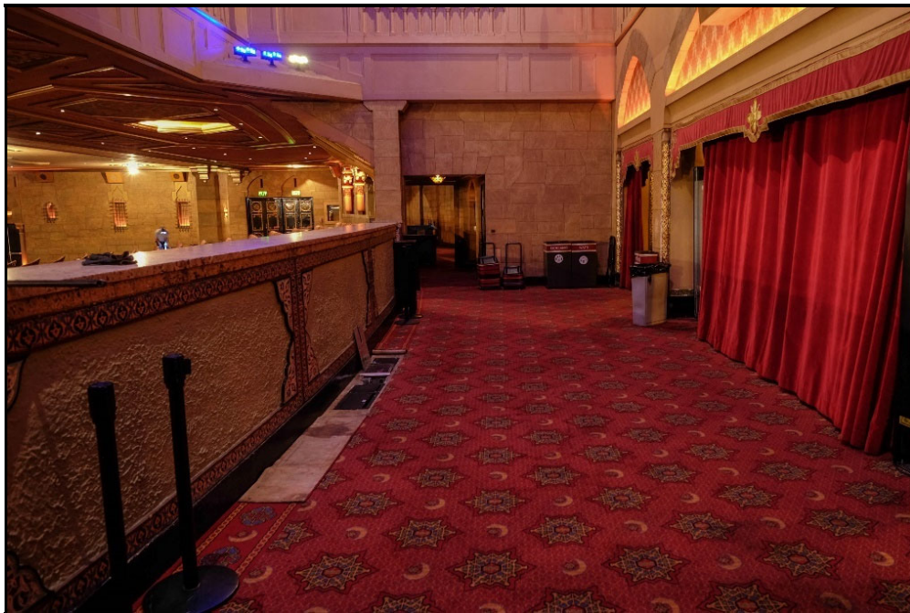
OASIS MIX POSITION LIGHTING / VIDEO / CAMERA