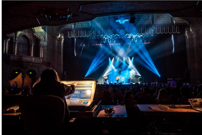
ROCK AND ROLL MIX POSITION – MIXING SHOW