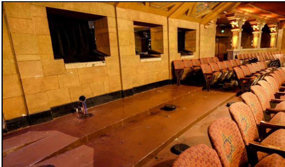
BROADWAY MIX POSITION & FOX SOUND BUNKER