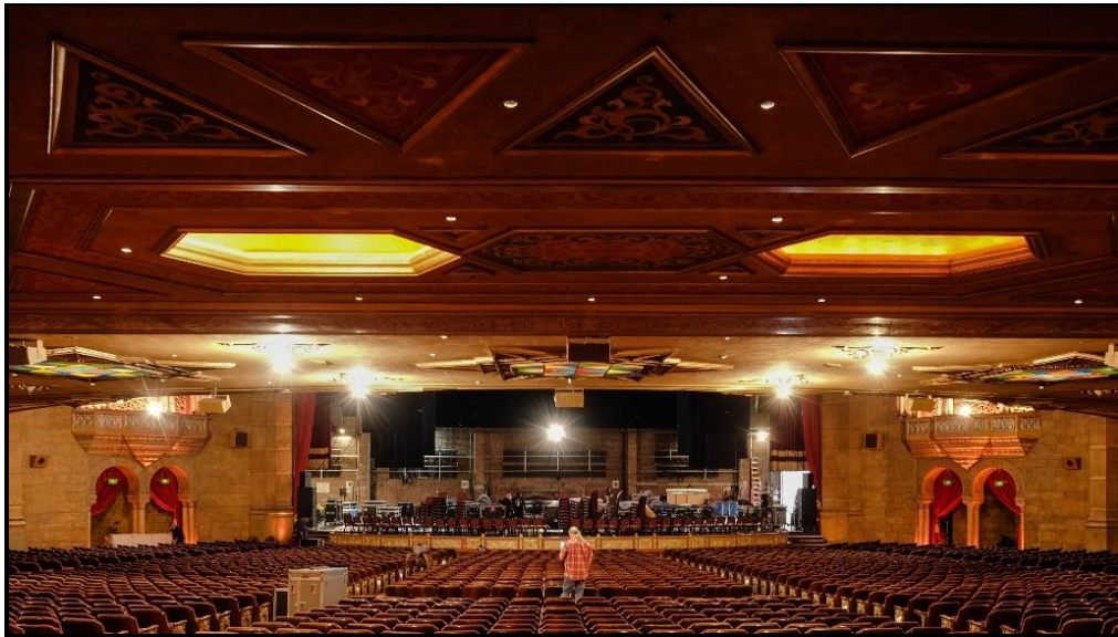
OASIS MIX POSITION VIEW FROM MIX TO STAGE