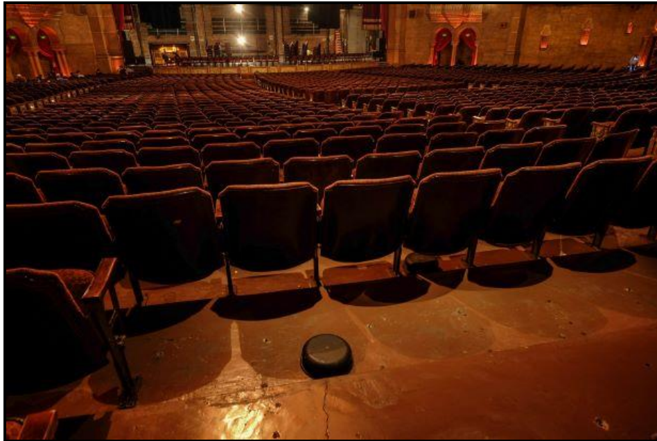
BROADWAY MIX POSITION VIEW TO STAGE