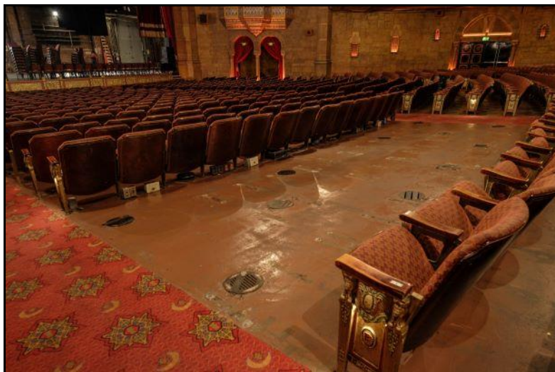
EMPTY ROCK AND ROLL MIX POSTION