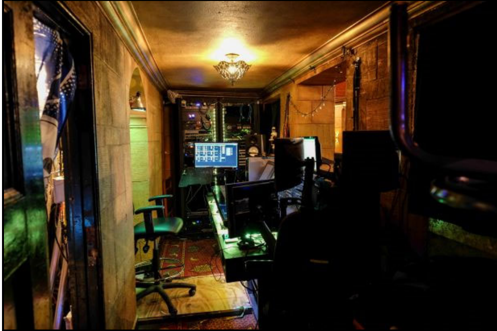
FOX FOH SOUND -CONSOLE IS PERMANENTLY INSTALLED