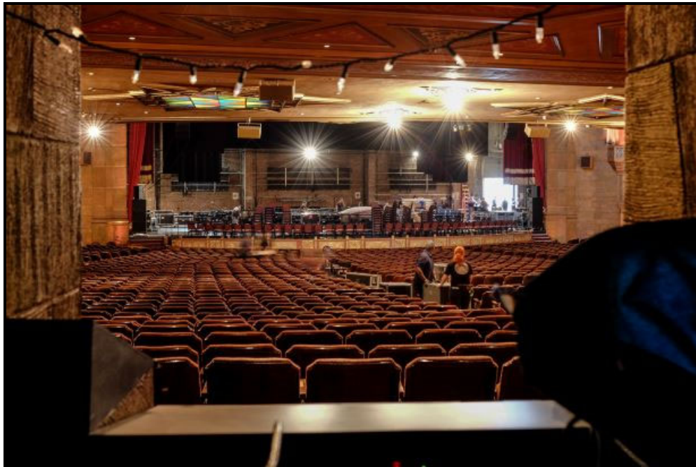
STAGE VIEW FROM FOH SOUND BUNKER