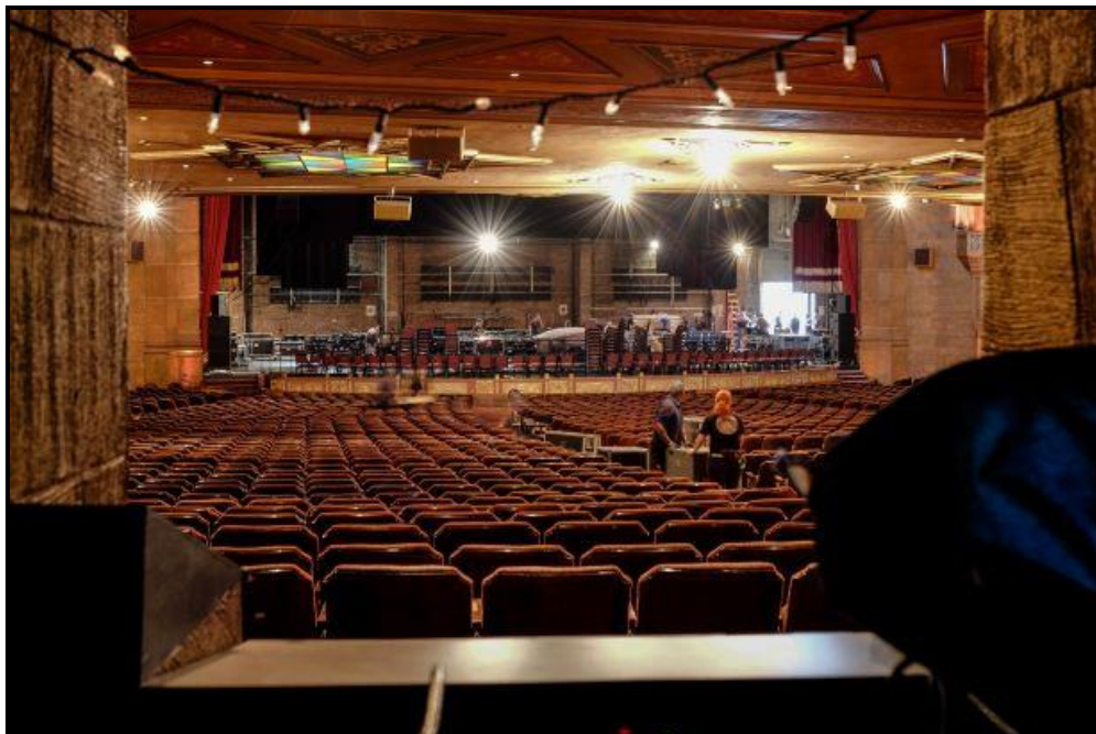
STAGE VIEW FROM FOH SOUND BUNKER