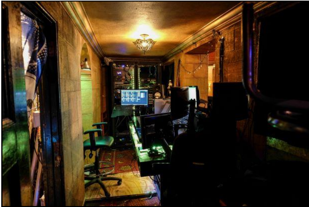
FOX FOH SOUND -CONSOLE IS PERMANENTLY INSTALLED